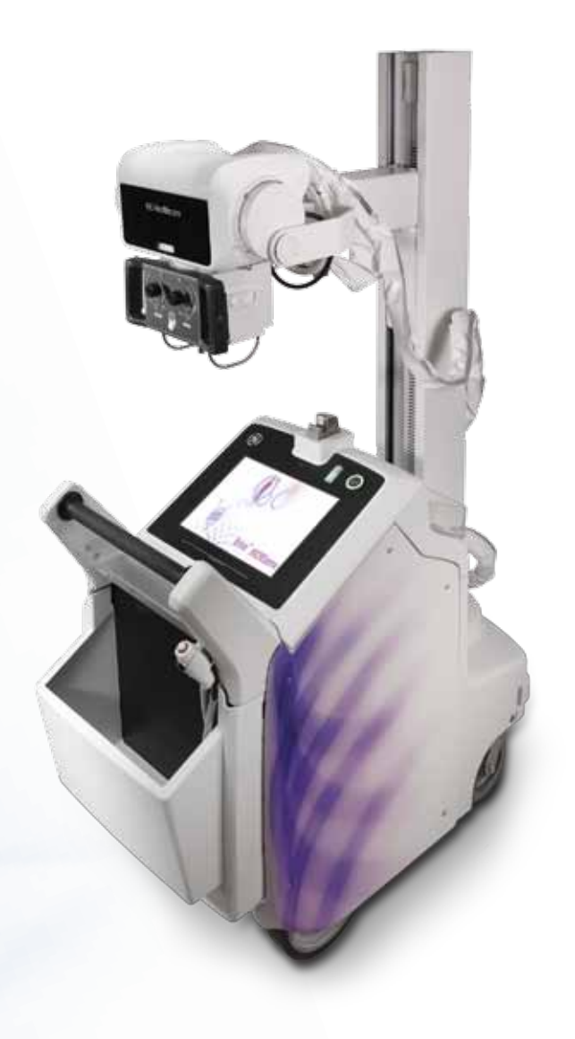
Brivo* XR285amx Just what you need.

Enjoy the freedom to upgrade to a fully integrated mobile solution on your schedule.