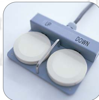
Remote elevator control.