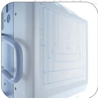
Standard hand grips for anterior and lateral exposure of auxiliary tools.