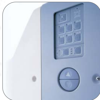
Dual-sided operational panels for ease of use.