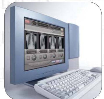
CS-1 Control Station.